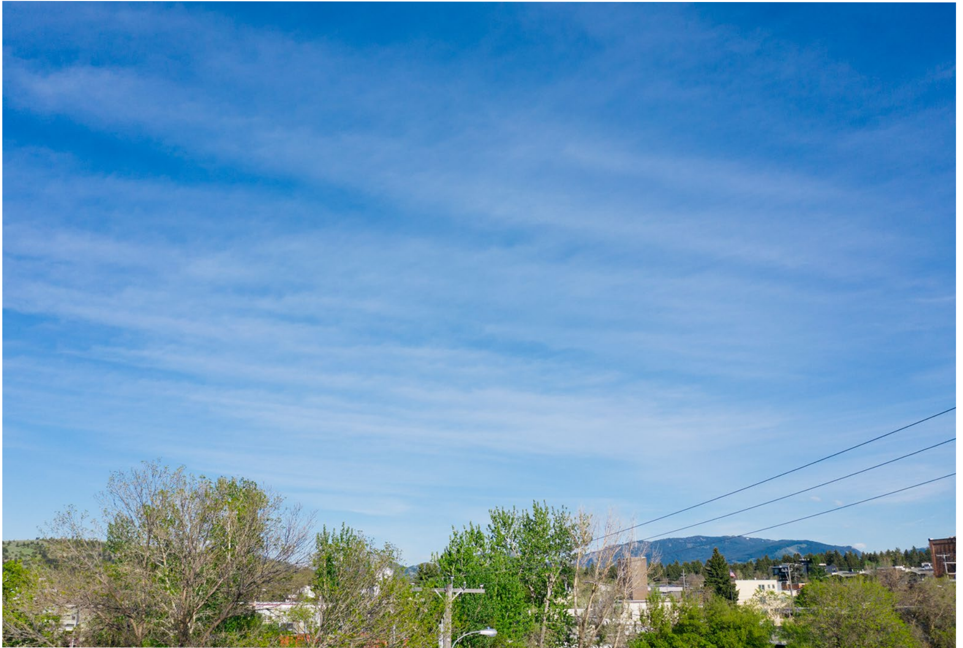
SOUTH EAST VIEW UNIT 201